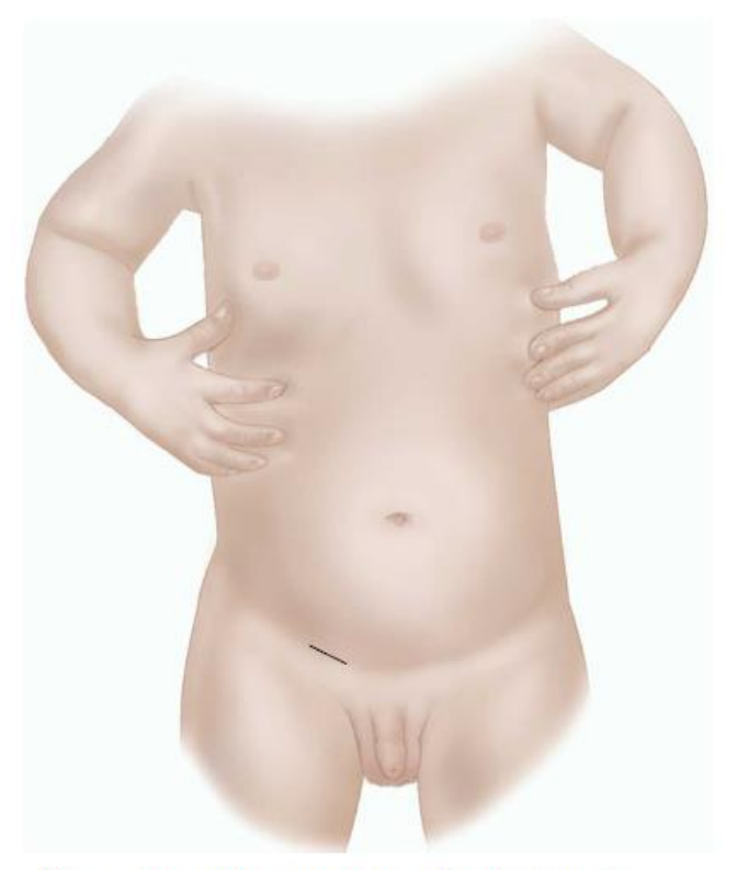
The cut usually made to repair a hydrocele

Your surgeon will make a cut on the groin. The cut is usually made close to a skin crease so that the scar is harder to see.