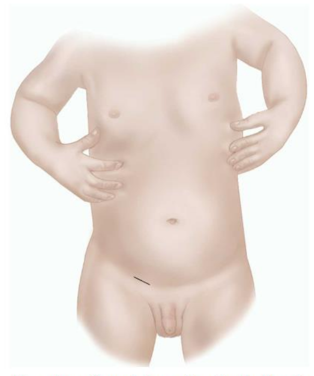
The cut usually made to repair an inguinal hernia

Your surgeon will put back the contents of the sac into the abdominal cavity and peel the sac away before tying it off. They will close the skin with disposable stitches.