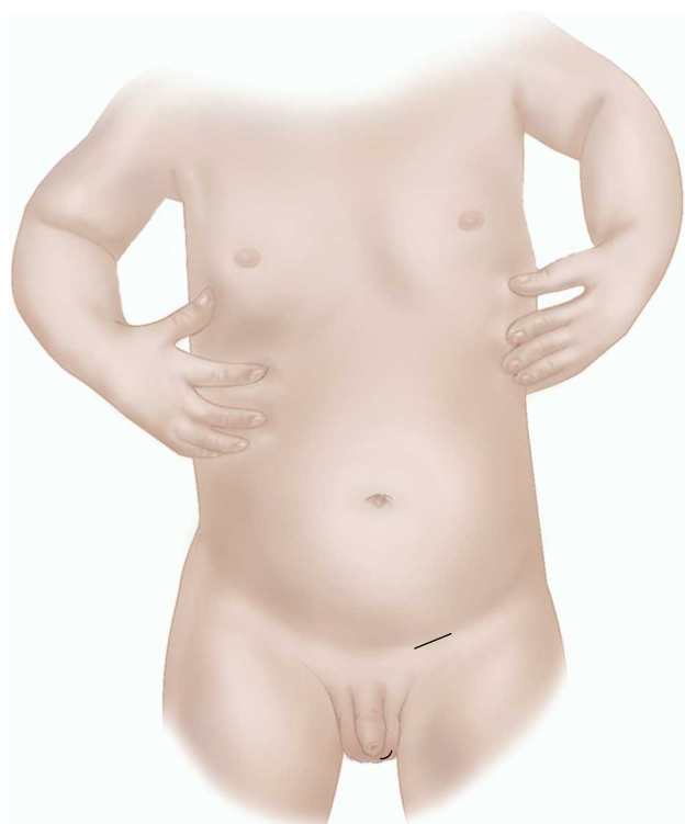
The cuts usually made for an orchidopexy

While your child is under the anaesthetic and before surgery, your surgeon will usually feel for the testicle in the groin. If it is healthy, the aim is to bring it down into the scrotum. Your surgeon will usually perform the operation through a cut on the groin and a small cut on the scrotum. However, your surgeon may use only a single cut on the scrotum.